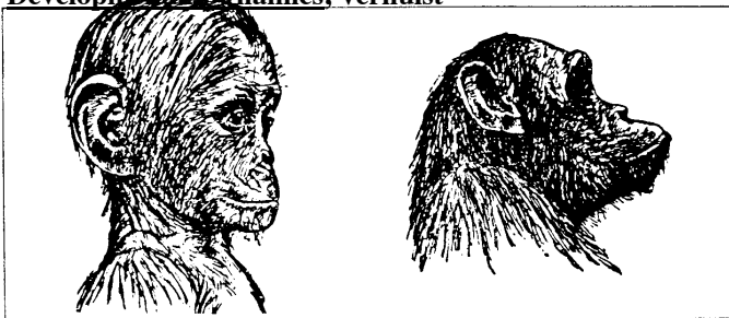
Fig. 2: Head of an infant chimpanzee and an adult (after Naef, 1926a). Naef's photos of chimpanzees are well known and have been reproduced or copied as drawings in countless books. Note the young ape's domed forehead (still without brow ridges), its still underdeveloped muzzle, the relatively low position of its shoulders, and its clearly visible neck.