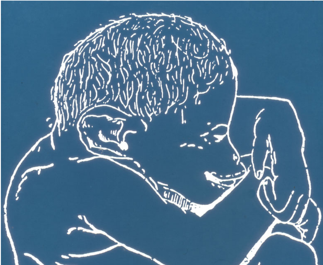
Developmental Dynamics, Verhulst